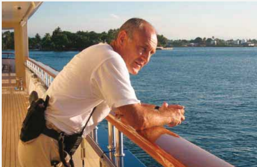
A good PMSC will develop an onboard strategy around the client's need