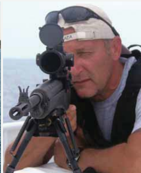
PMSCs must have experience of gun use