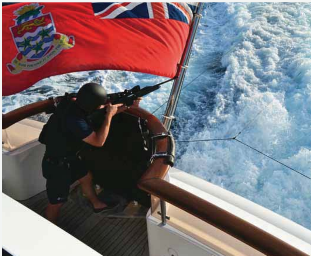
Whether security personnel should be armed is one of the most debated issues

T he modern world is perceived as a place of uncertainty, where people's safety and security is paramount. When it comes to the safety of the maritime world, we immediately think of piracy as the main threat. Films such as Captain Phillips brings this more into our consciousness even though it has been reported by the International Maritime Bureau (IMB) that the number of pirate attacks worldwide had fallen in the first half of 2013. It seems the reduction is due to a number of reasons, including the effort of the new Somalian government.